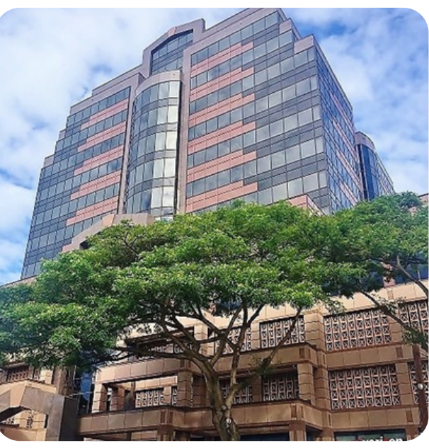
1440 Kapiolani Boulevard, Suite 1100 Honolulu, HI 96814 USA